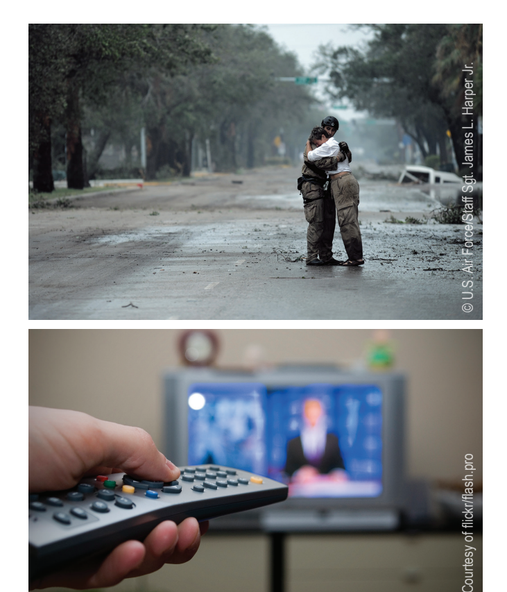
(Top) Rescue worker receives hug from Galveston, TX resident. (Bottom) People experience the threat of climate change through frequent media coverage.