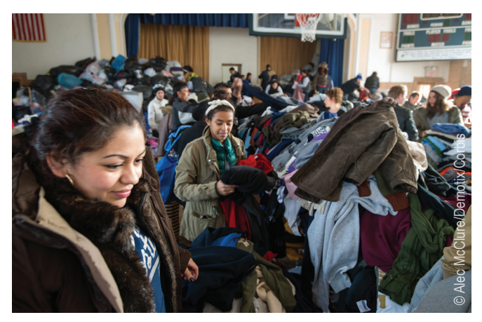
Residents and volunteers in the Rockaways section of Queens in New York City filter through clothes and food supplies from donors following Superstorm Sandy. November 3, 2012.

Key Finding 2: Specific groups of people are at higher risk for distress and other adverse mental health consequences from exposure to climate-related or weather-related disasters. These groups include children, the elderly, women (especially pregnant and post-partum women), people with preexisting mental illness, the economically disadvantaged, the homeless, and first responders [High Confidence] . Communities that rely on the natural environment for sustenance and livelihood, as well as populations living in areas most susceptible to specific climate change events, are at increased risk for adverse mental health outcomes [High Confidence] .